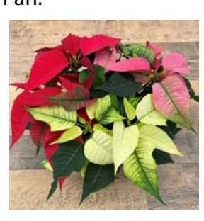
Santa's Table Top 8" Tri Pan.