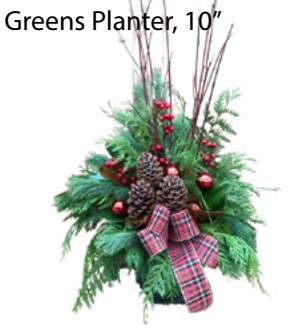
Nature's Blend Outdoor Greens Planter 10"