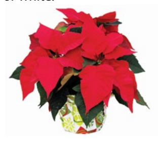
Winter Wonderland 6" pot. Available in red, pink, or white.