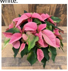
Holiday Blast 8" pot. Available in red, pink, or white.