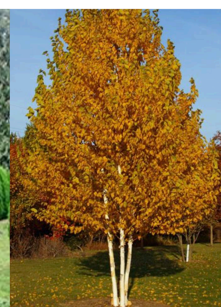
Betula papyrifera Paper Birch Sun Exposure: Full Sun or Partial Shade Soil Type: Normal or Sandy or Clay Height: 15-20m Spreading: 7-15m