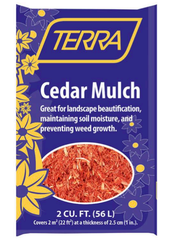
Total: 36 Bags of Mulch