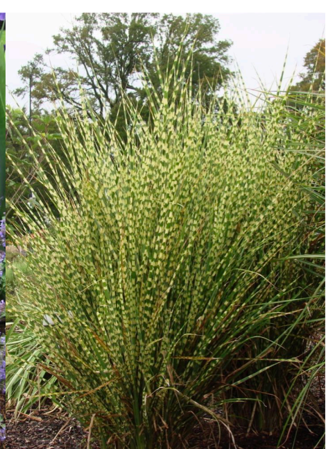
Miscanthus sinensis 'Zebrinus' Zebra Grass Sun Exposure: Full Sun or Partial Shade Soil Type: Normal or Sandy or Clay Blooming Time: Fall Height: 180-240cm Spreading: 80-90cm