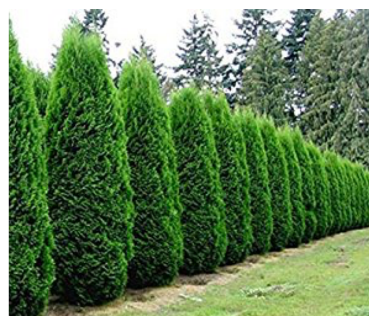
Thuja occidentalis American arborvitae Sun Exposure: Full Sun or Partial Shade Soil Type: Normal or Sandy or Clay Height: 9-16m Spreading: 3-4m