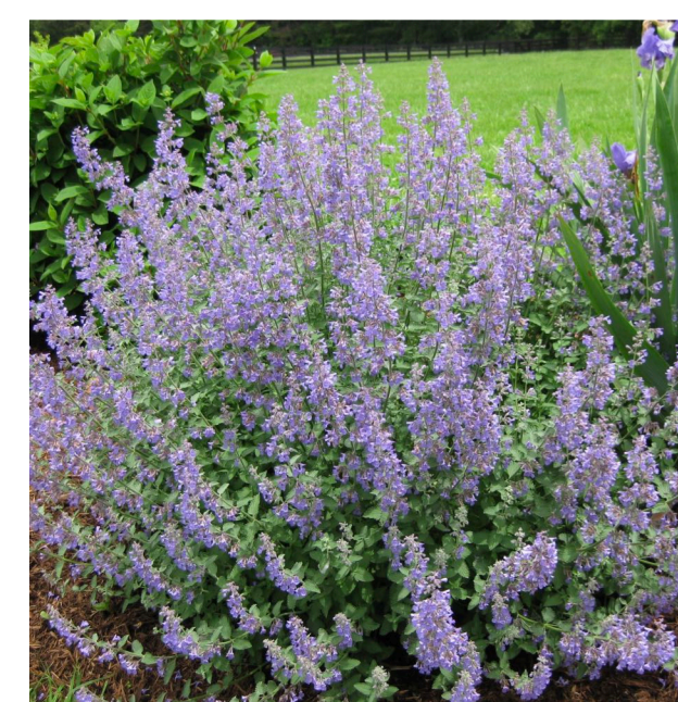
Nepeta racemosa 'Walker's Low' Walker's Low Catmint Sun Exposure: Full Sun or Partial Shade Soil Type: Normal or Sandy or Clay Blooming Time: Summer to Fall Height: 60-90cm Spreading: 75-90cm