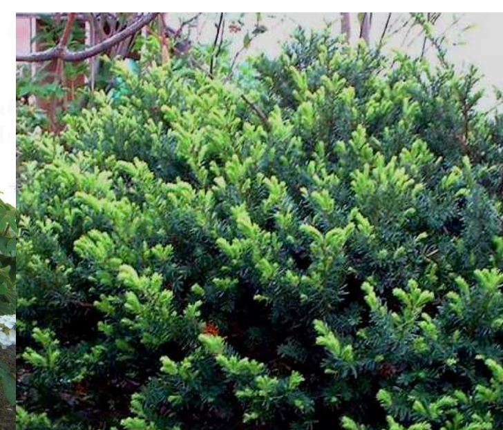
Taxus x media 'Wardii' Ward's Yew Sun Exposure: Full Sun to Full Shade Soil Type: Normal or Sandy Height: 100cm Spreading: 200cm