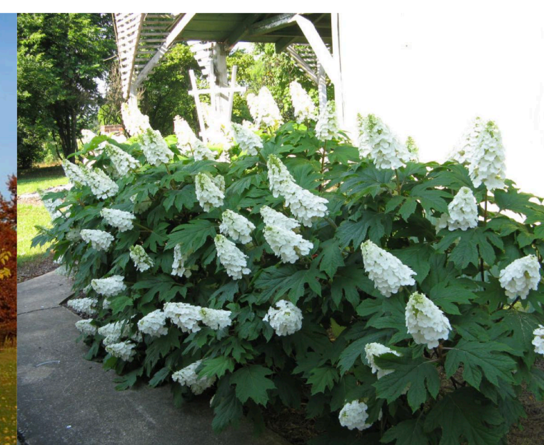
Hydrangea quercifolia Oakleaf Hydrangea Sun Exposure: Full Sun or Partial Shade Soil Type: Normal or Sandy or Clay Blooming Time: Summer Height: 2-3m Spreading: 2-3m