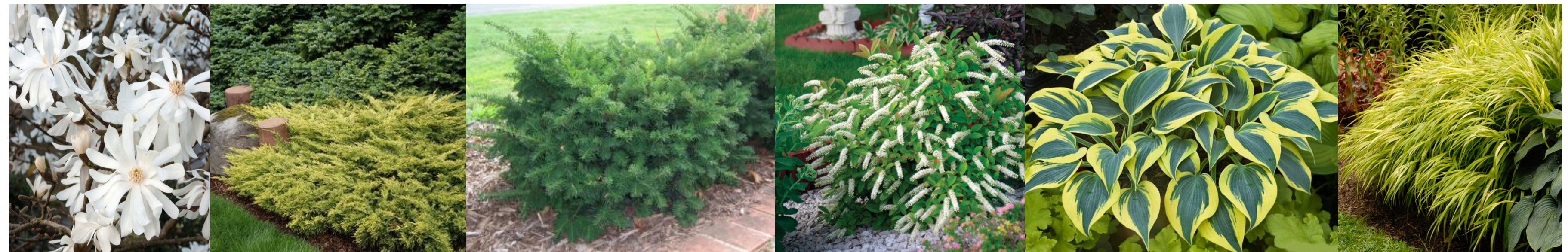
Magnolia stellata 'Royal Star' Star Magnolia Sun Exposure: Full Sun to Partial Shade Soil Type: Normal or Sandy or Clay Blooming Time: Early Spring Height: 300cm Spreading: 300cm Juniper horizontalis 'Limeglow' Lime Glow Juniper Sun Exposure: Full Sun to Partial Shade Soil Type: Normal or Sandy Height: 50cm Spreading: 100cm Taxus x media 'Wardii' Ward's Yew Sun Exposure: Full Sun to Full Shade Soil Type: Normal or Sandy Height: 100cm Spreading: 200cm Ita virginica 'Henry's Garnet' Virginia Sweetspire Sun Exposure: Full Sun to Full Shade Soil Type: Normal or Sandy Height: 100-200cm Spreading: 100-200cm Hosta 'Autumn Frost' Autumn Frost Hosta Sun Exposure: Partial Shade to Full Shade Soil Type: Normal or Sandy Height: 35-40cm Spreading: 30-45cm Hakonechloa macra 'All Gold' All Gold Japanese Forest Grass Sun Exposure: Partial Shade to Full Shade Soil Type: Normal or Sandy Height: 30-45cm Spreading: 30-45cm