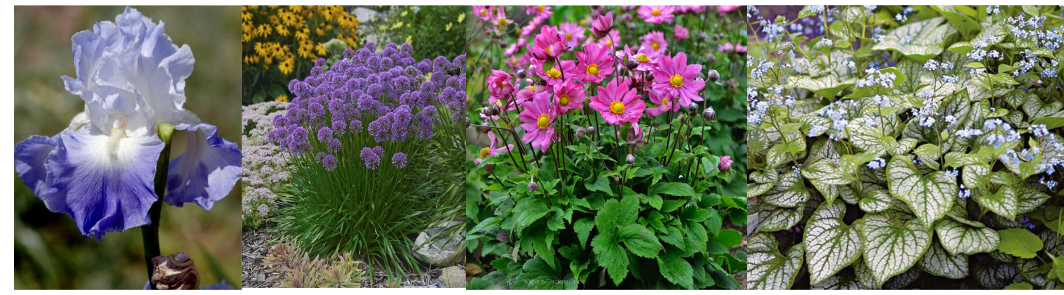
Iris germanica 'Clarence' Clarence Iris Sun Exposure: Full Sun to Partial Shade Soil Type: Normal or Sandy Blooming Time: Spring to Fall Height: 50-60cm Spreading: 50-60cm Allium x Millenium Ornamental Onion Sun Exposure: Full Sun to Partial Shade Soil Type: Normal or Sandy Blooming Time: Early Summer Height: 45-50cm Spreading: 25-35cm Anemone 'Curtain Call Deep Rose' Japanese Anemone Sun Exposure: Full Sun to Partial Shade Soil Type: Normal or Sandy Blooming Time: Summer to Fall Height: 35-45cm Spreading: 40-45cm Brunnera macrophylla 'Jack Frost' Siberian Bugloss Sun Exposure: Partial Shade to Shade Soil Type: Normal or Sandy or Clay Blooming Time: Spring Height: 30-40cm Spreading: 30-45cm

Soil And Mulch Requirement: Use this data to figure out how much product you need to complete your project. Total: 226 ft 2 Notes: Soil Depth of Rain Harvesting Garden : 6"-12" Total: 29 Bags of Mulch Total: Min. Volume 151 Bags of Garden Soil